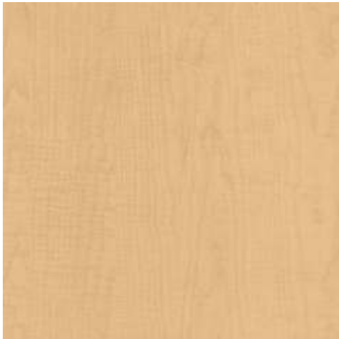
Maple - Unfinished