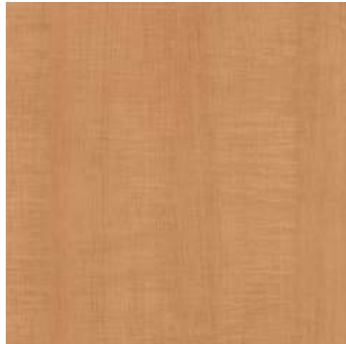
* Natural Maple

THE INFORMATION CONTAINED HEREIN IS SOLELY OWNED BY RESIDENTIAL ELEVATORS, INC. ANY REPRODUCTION IN PART OR AS A WHOLE WITHOUT WRITTEN PERMISSION FROM RESIDENTIAL ELEVATORS, INC. IS STRICTLY PROHIBITED.