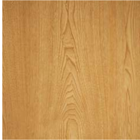
* Natural Oak