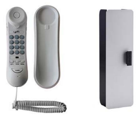
Figure 2: Standard Phone and Phone Box

For units that have a keypad phone, it will be on the COP. For units that have a standard phone, it will located in the phone box (see below).