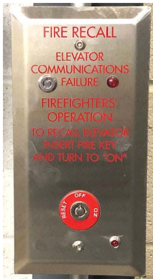
Figure 3 Phone Monitor

NOTE: There is an alarm silence key provided to turn off the beeper.