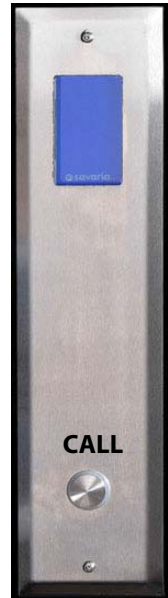
Figure 2 Hall Call Station

In the event of a building power failure, the door system is provided with a temporary power back-up system to continue the opening operation for a number of times. On resuming normal building power, the back-up system will turn OFF and begin automatically recharging.