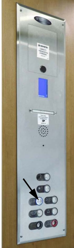
Figure 3 Door Open Button

When the elevator is at a landing level, the doors can be opened by pressing the Door Open button. Normally the doors will have opened and already closed automatically. The Door Open button allows the door to be reopened.