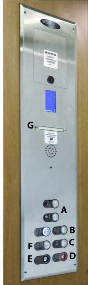
Figure 1 Keyed COP

This button can be pressed at any time to activate the optional hands-free phone in case of an emergency. The red light above the speaker will come on when two-way communication has been established. For units that have a standard hand-held phone, it is located in a separate phone cabinet in the cab.