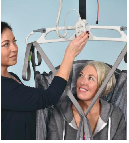
Stay Active and Independent inside your Home and On The Go.